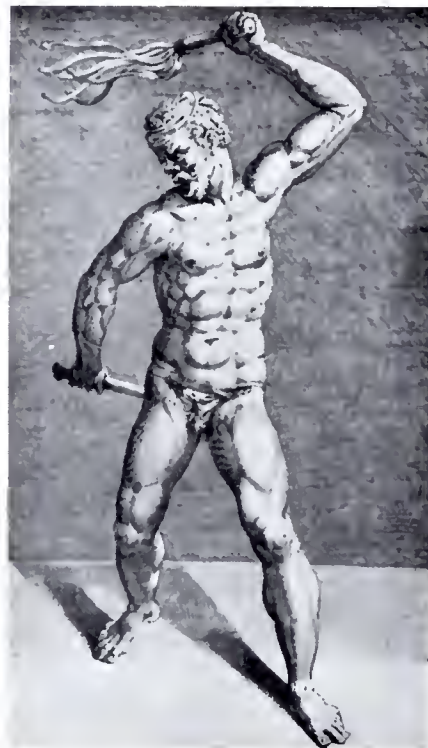
A MEDIAEVAL FLAGELLANT Italian; seventeenth century